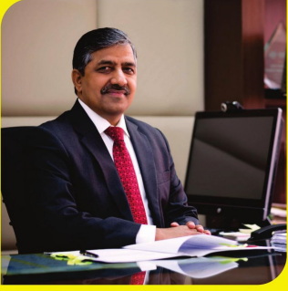
B C Tripathi CMD, GAIL

GAIL believes- it is in responding to the needs of the people, benefiting communities and protecting the environment which will ultimately lead to the larger goal of sustainable growth. The organization has a long-established reputation and relationship of engaging with the community and all its stakeholders. At GAIL we have always followed a structured approach to community engagement: adhering to government guidelines and international best practices while responding to stakeholders needs. Through an integrated umbrella of creating thinking, strategic blueprints, prudent partnerships and financial aid, the social investment of GAIL has endeavoured to provide a shot in the arm to the state's ideal of inclusive and equitable social development. The Swacch Bharat Abhiyan and Skill India specifically being zealously adopted by GAIL. Our social interventions have enabled us to make a positive and lasting social contribution to the society.