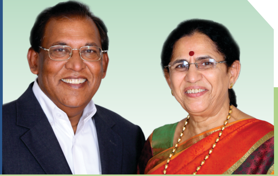
Founders & Trustees