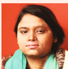
After 2nd surgery*