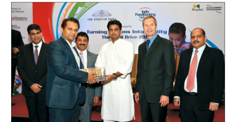
India Food Banking Network felicitates DLF Foundation on 'World Food Day'

Food Bank : In addition to its Flagship Programmes, the DLF Foundation has also continued to work on its initiatives like the establishment of Food Bank, launching of many Labour Welfare initiatives and undertaking many environmental initiatives.