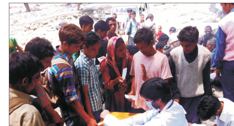
DLF Foundation undertakes Flood Relief Operation