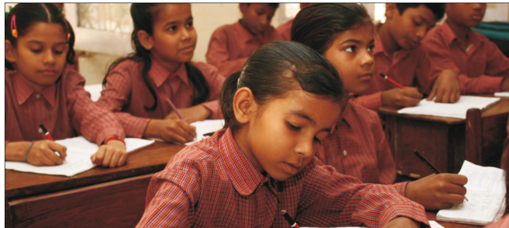
Towards holistic development of children

To uplift underprivileged students, DLF Foundation runs a variety of talent nurturing programmes such as awarding of merit scholarships and nurturing talent of rural children through a variety of interventions for marginalised students from Class 1 to Class XII and subsequently supports them to pursue their graduate and post-graduate studies. The project helps to identify, support and nurture talent of deserving children by giving them enough opportunities and space to realise their potential to the fullest. This programme aims to enable the selected scholars to access quality education in appropriate schools and ensures overall development through personality development, mentoring, handholding and counselling.