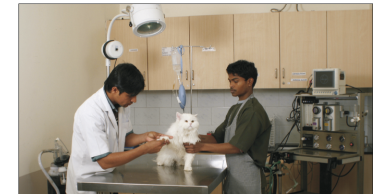
Pets being treated at the CGS Hospital

Veterinary Hospital: India's first State-of-the-art private veterinary hospital (CGS) in Gurgaon with ultra modern facilities like laser surgery, ultra sonic testing and modern lab facilities for animal care was established in Gurgaon.