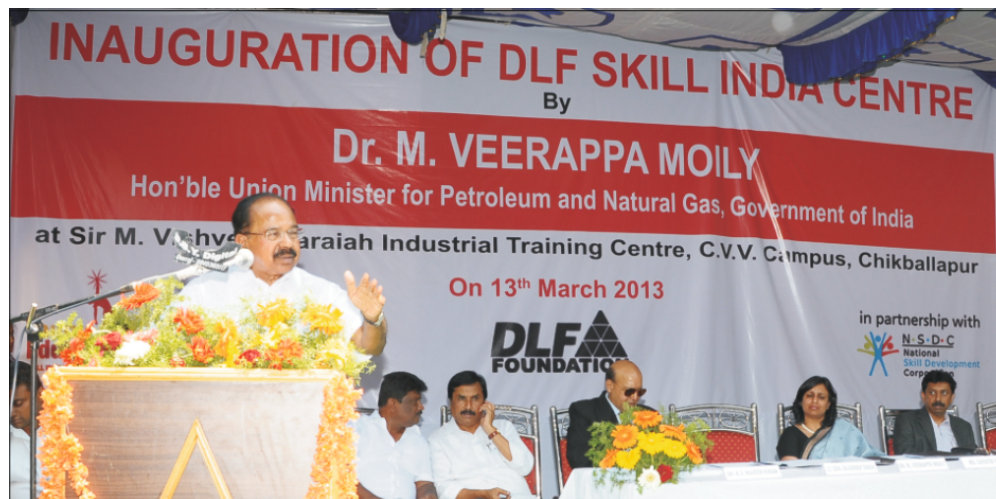
DLF Skill Centre launched under 'Skill a Million' Programme

DLF Foundation believes that skilling and linking training with employment is the key for India's growth. With the aim to skill and provide jobs to one million youth across the country in the areas of IT, Construction, Electronics, Retail, Customer Services and Hospitality, the Foundation is establishing Skill Training Centres across the country. Assured Employment linkages have been built into the model to ensure its success. The Centres are well equipped with working laboratories to ensure focus on practical skills. The Skill Programme is being implemented in a manner where skill sector