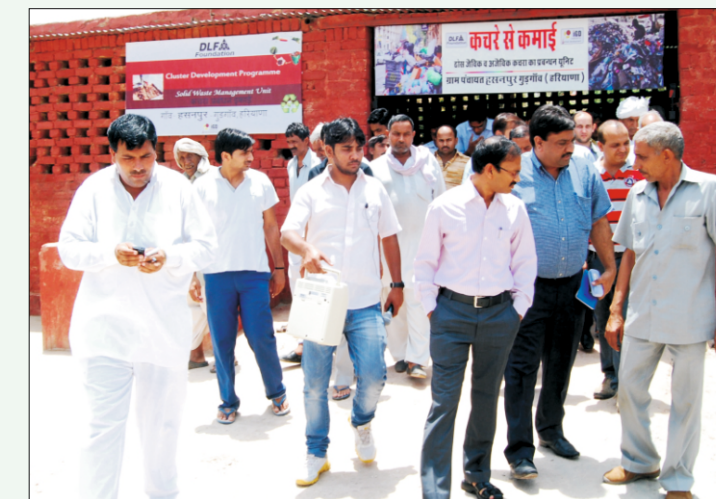
Empowering the underprivileged

The Cluster Development Programme aims to create opportunities for the underprivileged in order to facilitate a well built foundation. The programme has created new innovative precedents in the realm of nurturing talent. It facilitates integrated growth of villages and a holistic development of underprivileged communities. It also aims to transform identified cluster of villages into vibrant "Model Villages" and promotes these active, diverse and prosperous rural model villages as an easily replicable model for the development of other rural communities precisely on six major development areas: social, economic, environment, health, education and skill development.