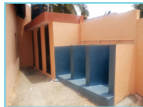
Construction of Toilets for a school in rural Karnataka