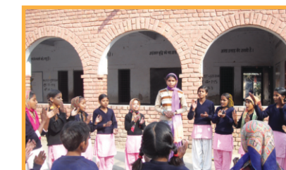
Remedial coaching in a school in Haryana