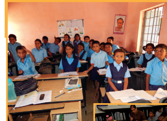
Support to students in a School in Karnataka

Tata Housing has reached-out to nearly ten thousand students from thirty five schools during 2013-14 through various initiatives like remedial coaching and infrastructural support etc. 'Tata Housing Scholarship for Meritorious Girl Students' studying degree in Civil Engineering, Architecture and MBA in Construction Project Management, is one of its flagship educational initiatives. The scholarship amount is Rupees sixty thousand per student per year.