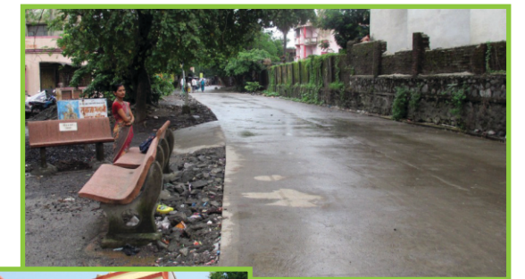
Road Reconstruction undertaken in a village near Kalyan

Tata Housing has provided vocational skill development training to more than four thousand socio-economically backward youth during the year 2013-14. It is working towards an ambitious target of training more than thirty thousand youth in various skill development initiatives by the year 2017-18, mostly in construction related trades. It has integrated skill development training with entrepreneurship development and has created and nurtured around forty entrepreneurs in construction fields from among the socio-economically backward youth during the year 2013-14. It is one of the few companies in India to have adopted Supply Chain Diversity Policy and is proactively encouraging vendors and suppliers from SC and ST communities in its supply chain.