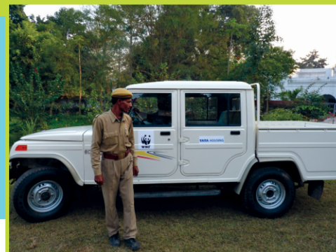
Tata Housing-WWF-India support government forest department front-line staff with vehicles for effective anti-poaching patrolling