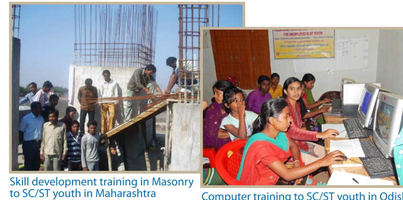
Skill development training in Masonry to SC/ST youth in Maharashtra

Tata Housing has established itself as a 'high growth pan India sustainable residential developer' and as one of the fastest growing companies in real estate sector in India with the Company's turnover growing 32 times since FY 2008. The Company envisions growth which is sustainable, balanced and equitable. It has been making continued efforts to build sustainability into everything it does so that its profitable growth reduces inequality and helps rejuvenate the environment. Tata Housing's sustained growth can be attributed to its adherence to triple-bottom-line principles across the value chain of the organization and its firm faith in shared value creation. The Company promotes employee volunteering and during the year 2013-14, ninety percent of its employees have remained active volunteers doing on an average ten hours of volunteering each. It has also the unique distinction of having all its construction green certified (pre and or post). Its CSR spend has been much above the current regulatory requirements.