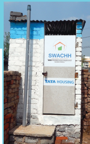
Toilets for the poor in Gurgaon in Haryana

Tata Housing has reached-out to nearly ten thousand students from thirty five schools during 2013-14 through various initiatives like remedial coaching and infrastructural support etc. 'Tata Housing Scholarship for Meritorious Girl Students' studying degree in Civil Engineering, Architecture and MBA in Construction Project Management, is one of its flagship educational initiatives. The scholarship amount is Rupees sixty thousand per student per year.