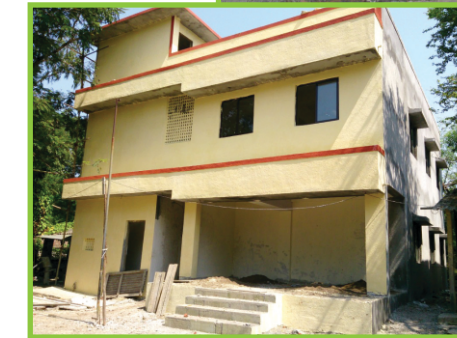
Construction of Community Centre Building in a village in Maharashtra