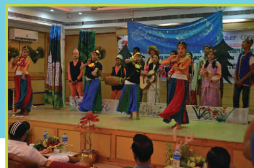
Environmental awareness among children in Sikkim through Dance-Drama programmes.