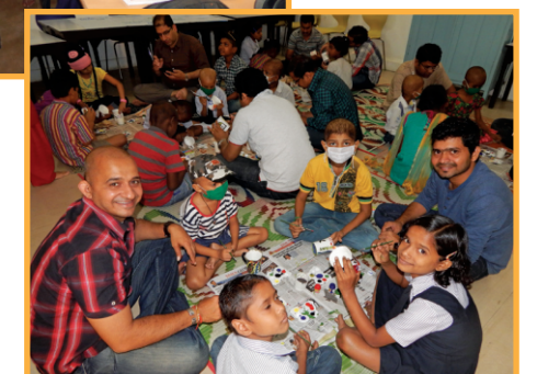
Employee volunteers helping cancer affected children in 'Painting Mugs' in Can-Kids School in Mumbai