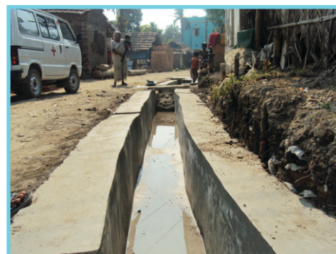
Construction of drain in a village in West Bengal