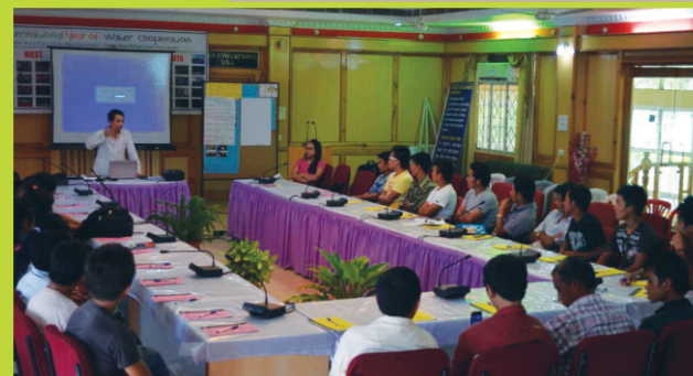
Orientation on Spring-shed Conservation to villagers in Darjeeling

Under Schools & Neighborhood Sanitation initiatives, Tata Housing has reached out to more than 15 thousand people during the year 2013-14 and created sanitation awareness among them. During the same year, it has constructed 315 individual family toilets for the poor at village Patharghata near Kolkata, Gurgaon in Haryana and in three villages near Ahmedabad. It has also constructed toilets in many schools across locations where it has presence. Company's 'clean toilets-green homes' drive has attracted huge public participation across India and is much acclaimed by all concerned. It has plans to construct five thousand toilets by 2017-18.