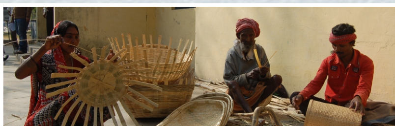
Basket making training in Rihand