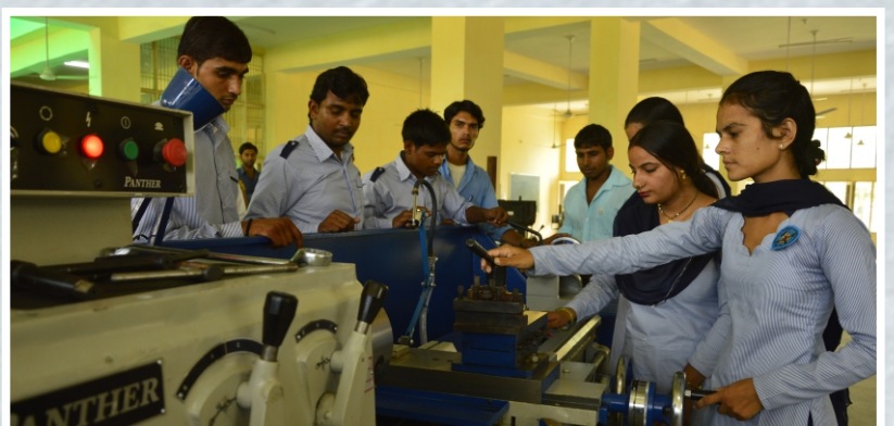
ITI at Jhajar

About 10200 students trained from these ITIs have got placements.