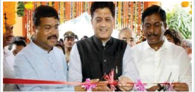
Inauguration of Training Center at Angul, Odisha

The multi skill training centre has started functioning at Talcher Kaniha, Distt.- Angul(Odisha) with 03 courses namely 1. Trainee Associate (Retail Sector); 2. BPO - Voice/ Non-Voice (IT/ITES Sector) and 3. Customer Care (Telecom Sector).