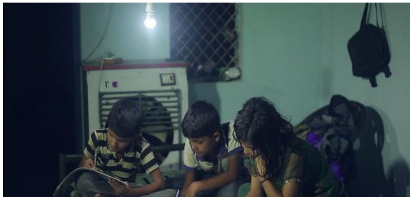
Households illuminated by the provisioning of solar lighting services