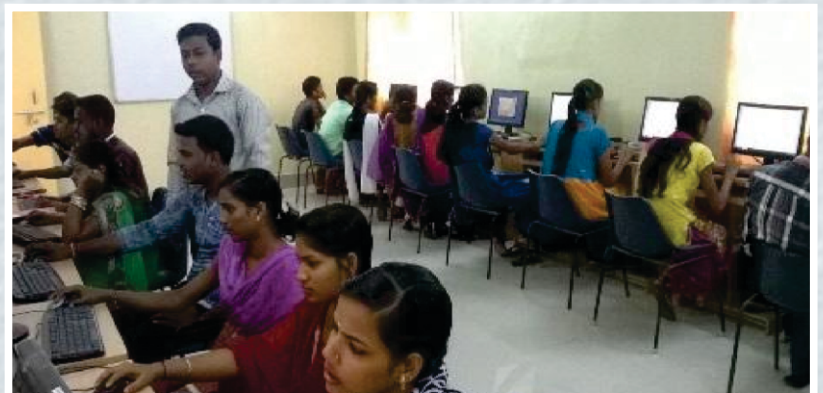
Training underway in NTPC Angul