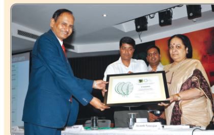
'Green Rating Award 2012'