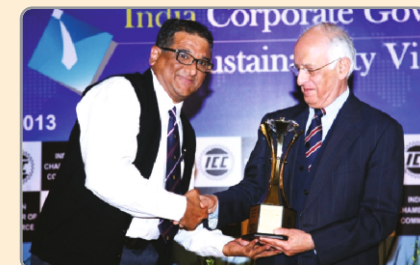
'Corporate Governance & Sustainability Vision Award 2012'