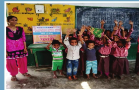
Improving learning outcome in primary education through project-based learning to 3000 students studying in Azamgarh district, U.P.