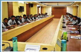
Providing job oriented skill development training to beneficiaries belonging to economically weaker sections at CIPET, Murthal

Approximately, 10,000 children are benefited from various interventions in the schools which range desks, benches, improved infrastructure, consumables or special aid for visually impaired children. In addition, a number of activities were carried out under the projects sanctioned in earlier years. Some glimpses of the sanctioned projects from 2018-19 and the earlier years are given below: