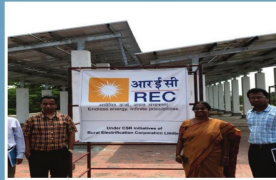
Installation of solar PV plant on campus of IIT Madras to reduce carbon footprint and promote green energy in the campus