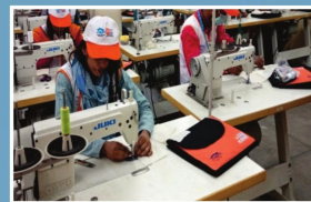
Providing skill development to youth at ATDC centre, Gurgaon, Haryana

REC supported a number of initiatives for differently abled persons across India. Some of these initiatives include, supplying cochlear implants to children with hearing impairment at various locations in India; construction of integrated muscular dystrophy and rehabilitation centre 'Manav Mandir' providing aids and appliances to specially abled persons of the society. In addition, REC is part-funding for community-based program for control of sickle cell disease and Thalassemia in the 30 districts of Odisha.