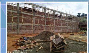
Construction of multipurpose hall cum indoor stadium in Somdal village in Ukhrul district, Manipur