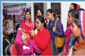
Providing skill development to women residing in Mewat district, Haryana