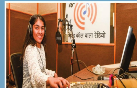
UNFPA launched a missed call based edutainment channel called Naubatbaja to raise voice on Child Marriage.