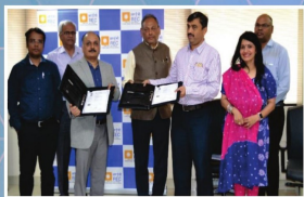
Signing MoA with Samarthanam Trust - job oriented Skill development training to 700 nos. of Specially abled and Economically weak beneficiaries at various locations in India in presence of Shri Ajeet Kumar Agarwal, CMD, REC Ltd.