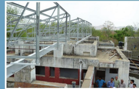
Installation of 135 KWP off-grid solar plant in campus of the SWRC (formerly known as Barefoot College), Tiloniya in Ajmer district of Rajasthan.

5 Thematic Area 5: Protection of national heritage, art and culture, including restoration of buildings and sites of historical importance and works of art; setting up public libraries; promotion and development of traditional art and handicrafts: