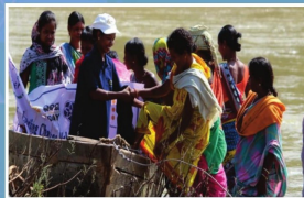
An Uday leader mobilizing the women for forming a self help group and teaching them about various Govt. Schemes.