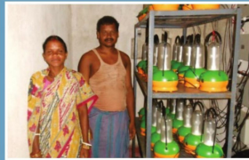
Setting up solar charging stations and distribution of solar lanterns in Odisha

By supporting projects for setting up solar PV panel in various institutions, development of Public Park, conservation & sustainable management of bio resources etc.