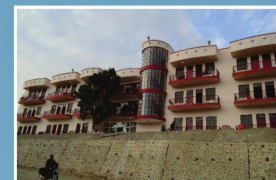
Construction of girl's hostel for students studying in THDC-Institute of Hydro Power Engineering & Technology at Tehri, Uttarakhand

REC launched A pilot initiative milk pouch distribution to students in 39 schools in Latehar district in collaboration with National Dairy Development Board. Under the programme each student received 200 milliliters of milk every day. It not only increased the nutrition to the students but also reduced drop out in schools. The students increased Body Mass Index, and other key health parameters. Government of Jharkhand was appreciative of the initiative has rolled out 'GIFT MILK' programme to more districts in the state.