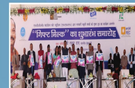
Inauguration of distribution of milk pouches to students studying in government schools of Latehar district Jharkhand in presence of Shri Raghuvar Das, Hon'ble Chief Minister of Jharkhand and Shri Ajeet Kumar Agarwal CMD, RECLtd