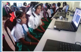
Establishment of Virtual Classrooms in Govt. high schools of Karnataka