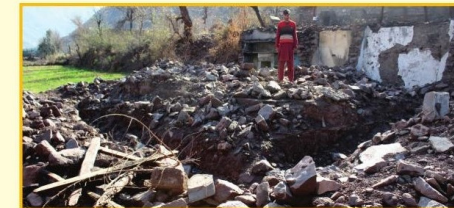
Village house destroyed by terrorists

Recently, ONGC supported a rehabilitation project of three houses in Kalgai Village, near Uri which were destroyed during an operation by Army leading to elimination of four terrorist on 23-25 Sep 2017. The success of the complete operation was attributed to the timely information received from the villagers about presence of terrorists which highlights the bonhomie and confidence shared by Army with the locals. The families were rendered homeless due to the damage suffered during the operation, however there were no complaints, no regrets from the locals. The Army was prompt and provided immediate relief and pledged to re-build the houses at the earliest. At this stage, ONGC stepped forward to rehabilitate the three families and completed the project in a record time at a cost of Rs 15.73 Lakhs.