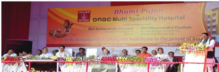
Hon'ble Minister of P&NG, at Bhumi Pujan Ceremony

ONGC multi-speciality hospital project at Sivasagar named after the first Ahom King of Assam Swargadeo Siu-Ka-Pha is the biggest ever CSR project undertaken in the history of ONGC CSR. Prior to taking up the project, M/s Pricewater House Cooper (PWC) was engaged to survey the health care scenario of Sivasagar and upper Assam. As per the Detailed Project Report submitted by PWC, it was found in entire upper Assam there was a bed deficit of 961 beds and in Sivasagar alone there was a bed deficit of 589 beds. Further, Sivasagar has only 0.52 hospital beds per 1000 population, much lower than national average of 1.1 beds per 1000 population. After thoroughly analysing the alarming health care scenario of upper Assam, ONGC Board accorded approval for setting up a 362 bed Multi Speciality Hospital at Sivasagar to be implemented in three phases at an estimated cost of Rs 316.09 Cr.