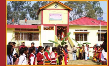
"Inauguration of Girls hostel at Hallong"