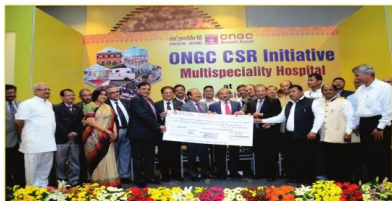
Handing over the first cheque to BAVP on signing of Agreement.