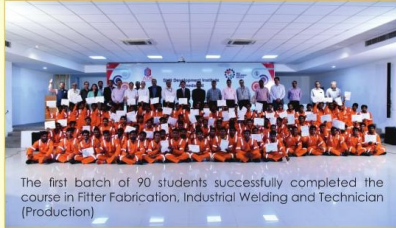
The first batch of 90 students successfully completed the course in Fitter Fabrication, Industrial Welding and Technician (Production)

Skill Development Institute, Ahmedabad, was inaugurated on September 23, 2017 by Union Minister for Petroleum & Natural Gas and Skill Development and Entrepreneurship, Shri Dharmendra Pradhan. The first batch of 90 students successfully completed the course in Fitter Fabrication, Industrial Welding and Technician (Production) after going through a six month residential training at the premises of ADS Foundation. The placement letter were handed over by Director (HR) of ONGC on 16th April 2018 to all 90 students. From next year onwards, the number of trades will be increased from three to nine, benefiting 780 youth during the year 2018-19, through ONGC's training partner ADS Foundation. Increasing the trades will raise the budget from current Rs 86.58 Lakhs to Rs 4.90 Cr in a year. A permanent centre will be set up at Ahmedabad with contribution from eight other Oil PSEs.