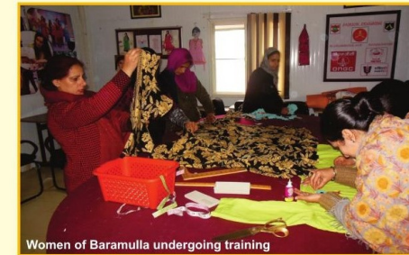
Women of Baramulla undergoing training

In the last two years ONGC in association with Chinar 9 Jawan Club has undertaken Skill Development program for empowering women and youth of Jammu & Kashmir. As part of this initiative 120 Kashmiri women from Baramulla and neighbouring areas have been trained in Fashion Designing, Cutting & Sewing at a cost of Rs 33.84 lakhs. Further, through another Skill development program, 150 youth in 'Hospitality' and 150 women in 'Retail Sales' has been imparted training at a cost of Rs 17.34 Lakhs. Out of the total 300 students, trained in Hospitality and Retail Sales, 201 (boys & girls) have already got placement in different industries. Some of them are placed in premier hotels like Taj and Maurya. These skill development training have been imparted through a NGO named REACHA. Prior to these initiatives in Jammu & Kashmir, ONGC took the initiative to construct 100 IHHL in the international border village of Babiya, Ladwal and Karol Bidho falling under Mahreen block of Kathua District in Jammu & Kashmir.