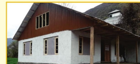
Village house after reconstruction