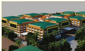
The 3D model of the Multi Speciality Hospital, Sivasagar.

ONGC multi-speciality hospital project at Sivasagar named after the first Ahom King of Assam Swargadeo Siu-Ka-Pha is the biggest ever CSR project undertaken in the history of ONGC CSR. Prior to taking up the project, M/s Pricewater House Cooper (PWC) was engaged to survey the health care scenario of Sivasagar and upper Assam. As per the Detailed Project Report submitted by PWC, it was found in entire upper Assam there was a bed deficit of 961 beds and in Sivasagar alone there was a bed deficit of 589 beds. Further, Sivasagar has only 0.52 hospital beds per 1000 population, much lower than national average of 1.1 beds per 1000 population. After thoroughly analysing the alarming health care scenario of upper Assam, ONGC Board accorded approval for setting up a 362 bed Multi Speciality Hospital at Sivasagar to be implemented in three phases at an estimated cost of Rs 316.09 Cr.