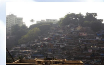
HILL TOP SLUMS AT WORLI NAKA, MUMBAI (INDIA)