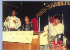
HON'BLE MINISTER, SHRI. SURESH PRABHU & SMT. NIRMALA SAMANTH PRABHA EX-MAYOR OF MUMBAI AT THE INAUGURAL FUNCTION OF FANCY REHABILITATION TRUST

Shri. Suresh Prabhu the Hon'ble Minister was the first person to give me a stepping stone to rehabilitate the illiterate & unskilled handicaps. Since I knew Shri. Suresh Prabhu very closely from the time he was the chairman of Saraswat Co- operative Bank Ltd. (INDIA). I shared my good vision & good thoughts to support the cause requesting him to provide suitable jobs for the handicaps such as housekeeping, cleaning of office equipments, binding of bank register stamping of documents etc. Shri. Suresh Prabhu was impressed by my concept and gave our NGO the first opportunity to clean his own flat situated at Khar (INDIA) on trail basis, he found the work of the handicaps to be satisfactory and considered my request to provide service to all the branches of Saraswat Bank. Thus I was able to rehabilitate nearly 400 handicaps & other less fortunate.