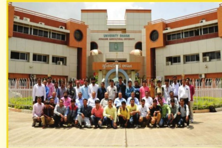
Diploma in Agriculture Extension Services for Agri-Input Dealers

Dhanuka is actively pursuing multi-facet extension programmes for capacity building of In-put Dealers and farmers.