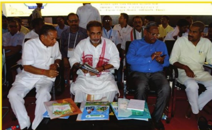
Krashak Goshthi' for 'Doubling Farmer's Income Organized by Dhanuka at Motihari, Bihar