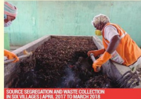
SOURCE SEGREGATION AND WASTE COLLECTION IN SIX VILLAGES | APRIL 2017 TO MARCH 2018

Bharathi Cement in partnership with CHF India Foundation, four local panchayat bodies and the Community has undertaken Integrated Solid Waste Management Project aligning to United Nation's Sustainable Development Goal - Make cities and human settlements inclusive, safe, resilient and sustainable.