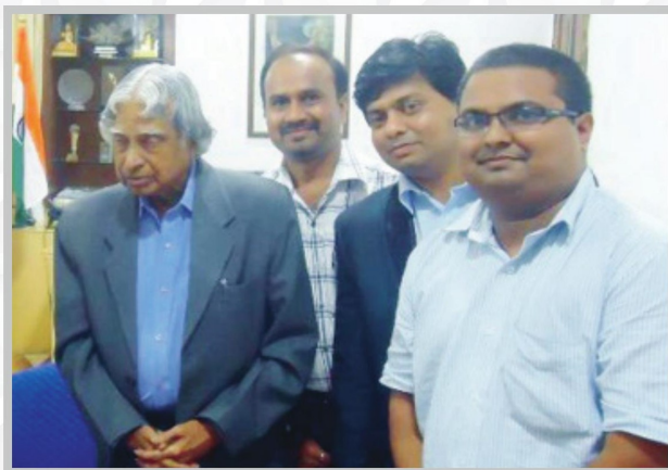
Dr. Kalam Appreciation