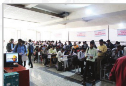
Job Fair, Pune