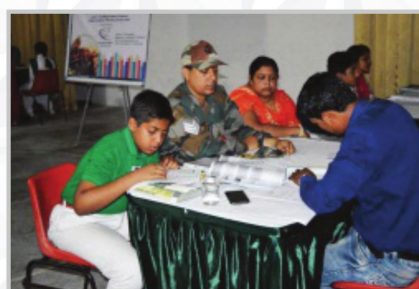
Career Counselling Session for Jammu & Kashmir Army Public School