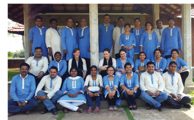
Sulzon Foundation Team